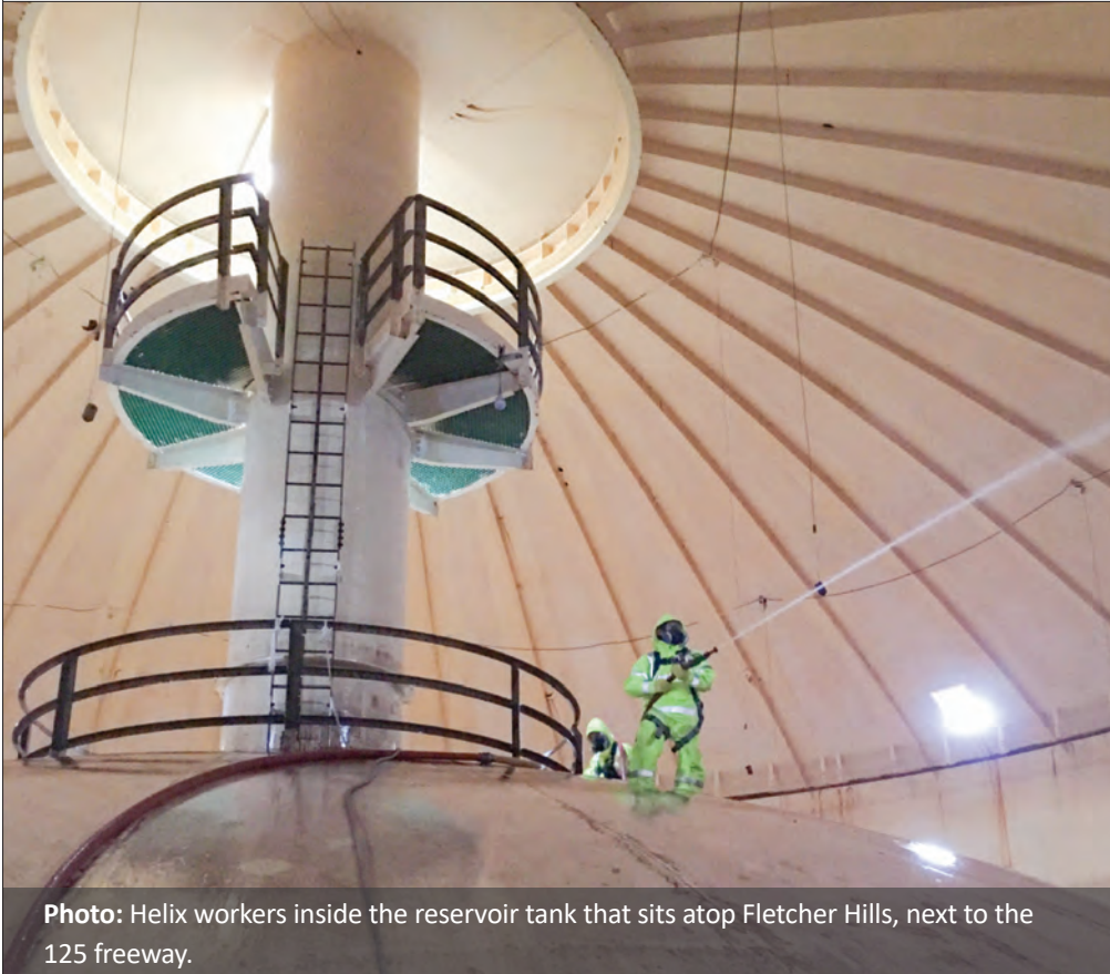
Photo: Helix workers inside the reservoir tank that sits atop Fletcher Hills, next to the 125 freeway.