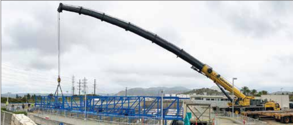
Photo: Crane lifts the bridge that spans the east sedimentation basin at Helix's water treatment plant. It supports vacuums that collect sediment from the basin floor. We are refurbishing the tracks on which the bridge moves.